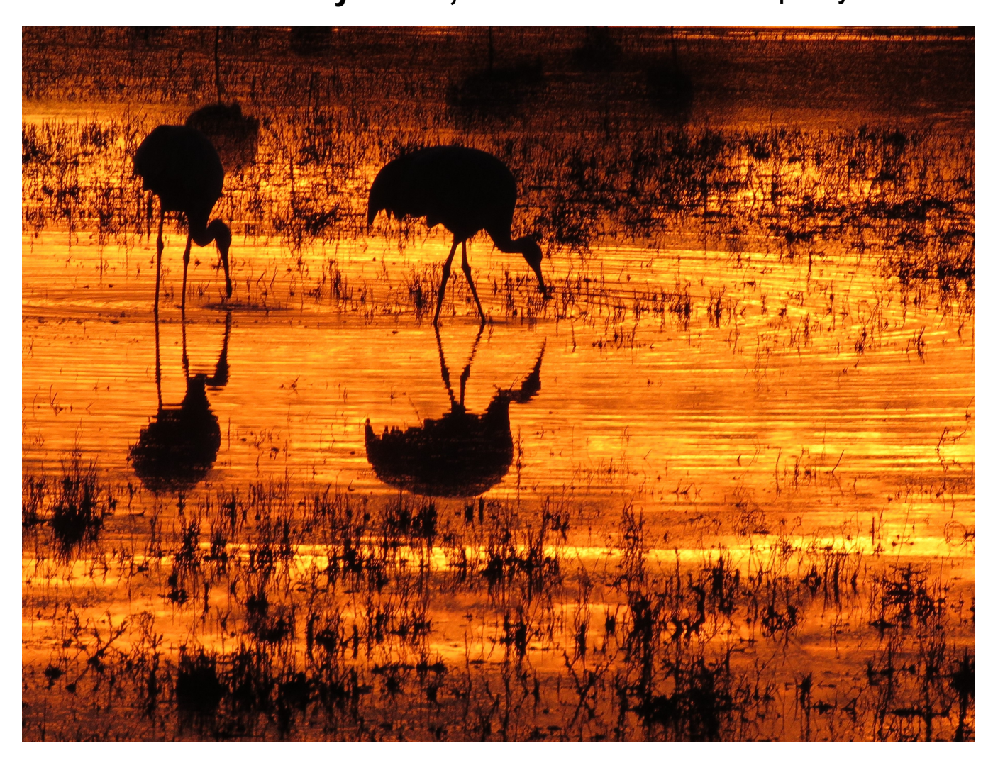
Photos: Black Rosy Finch and Sandhill cranes at Bosque del Apache by Gina Nichol. Blue-throated Hummingbird by Luke Tiller.