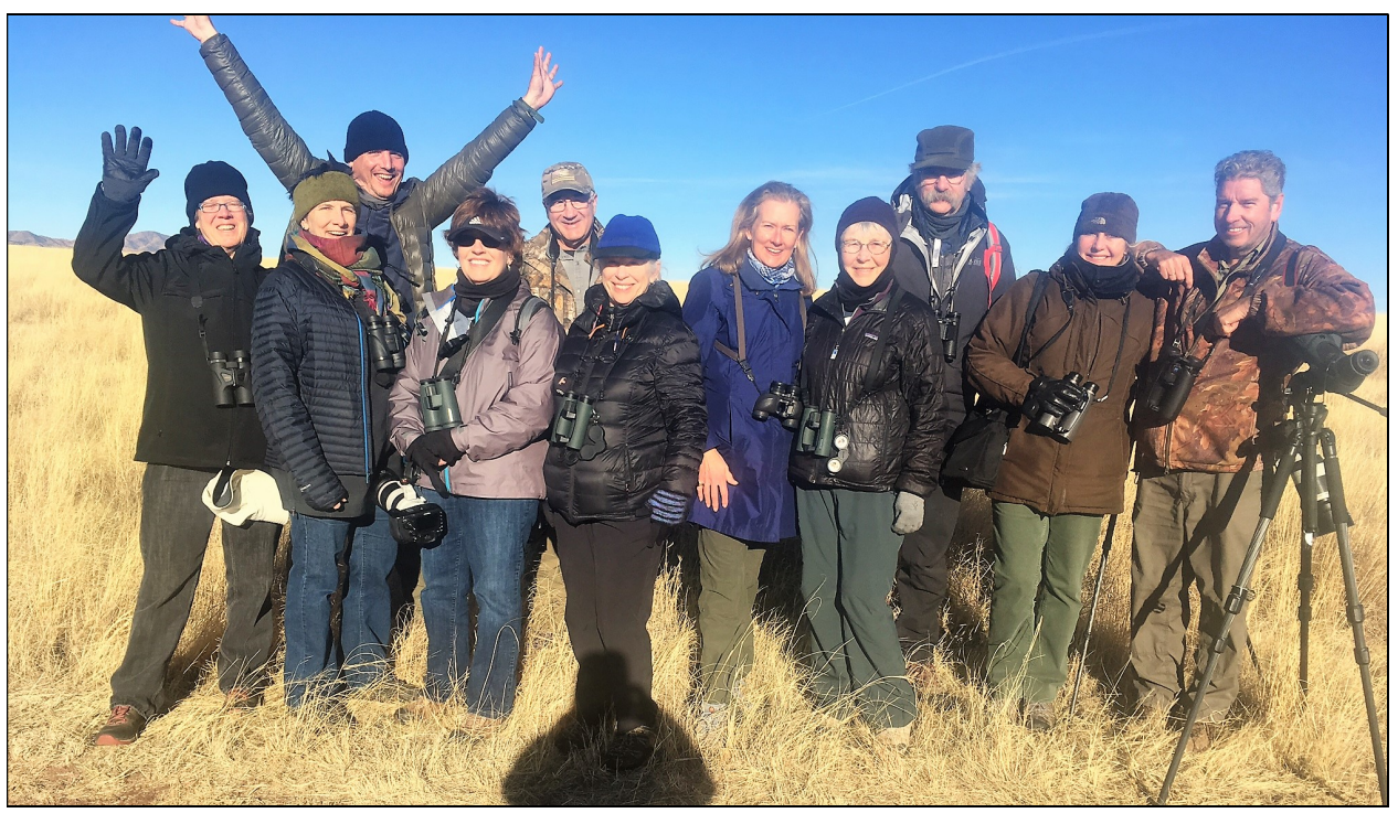
Baird's Sparrow Victory!

us flocks of Chestnut-collared Longspurs wheeled away and a cute little Grasshopper Sparrow popped up to try steal some of the Baird's limelight.