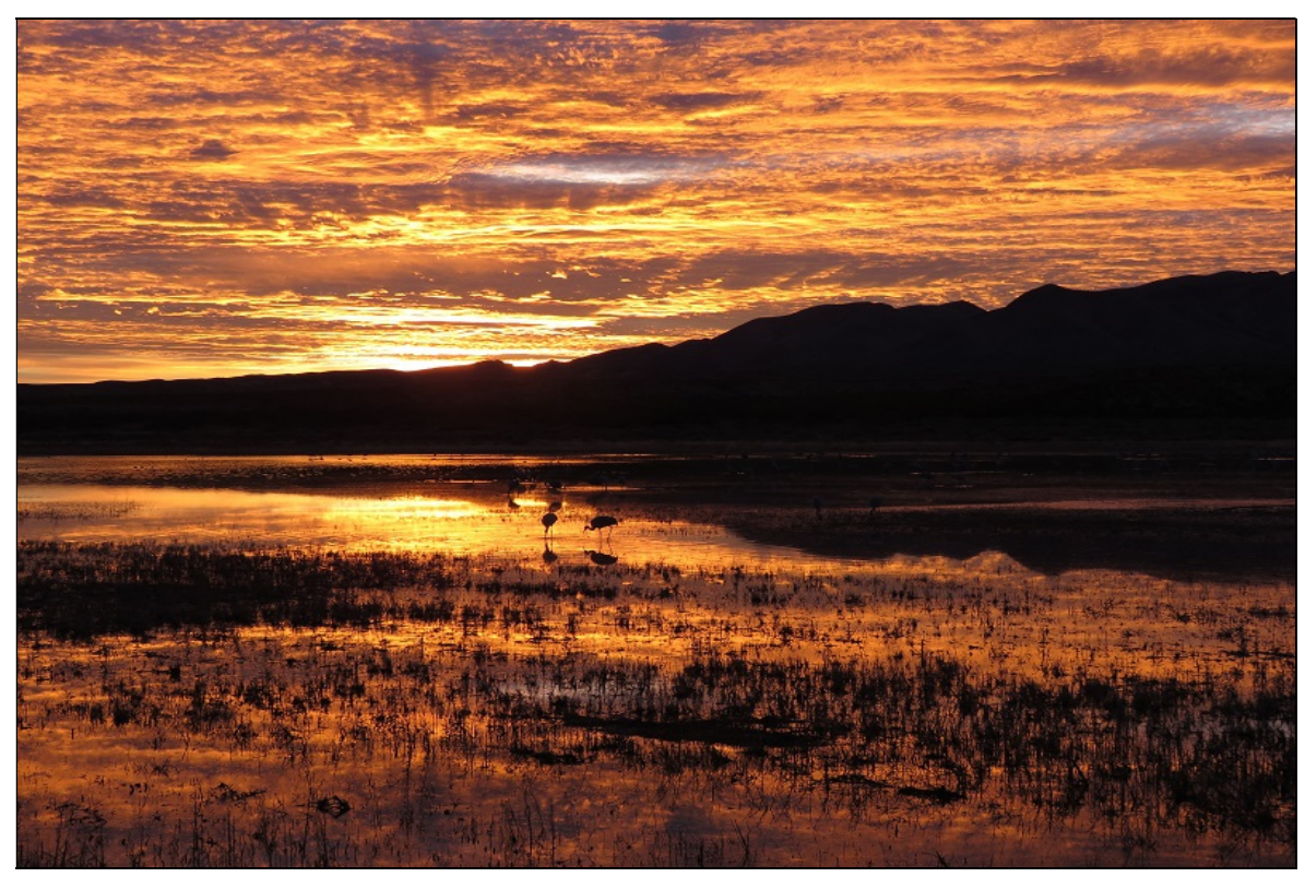
SUNRISE BIRDING LLC - 2018 NEW MEXICO & ARIZONA WINTER - TRIP REPORT

After a somewhat quiet visit to Water Canyon, we ended our day at the ponds just north of Bosque Del Apache. Here we arrived just in time to witness the arrival of numbers of both Lesser and Greater Sandhill Cranes. We also arrived just in time to witness an incredibly spectacular and dramatic sunset. As the sun set the sky lit up with flaming reds and yellows and bruised purples, a simply stunning setting for an end to a fun day.