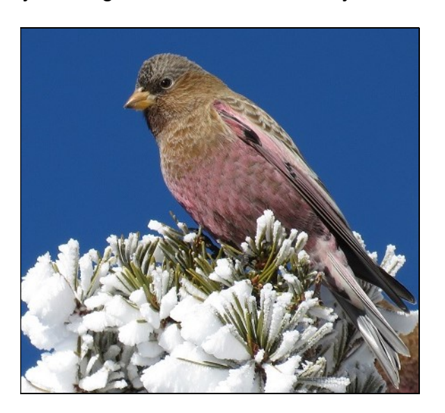
Photos: Gray-crowned and Black Rosy Finch, Brown-capped Rosy Finch by Gina Nichol.

least one of the striking "Hepburn's" Graycrowned Rosy-Finches to our sweep of these amazing birds. As well as these incredible birds we also managed to add an unexpected subspecies of Junco (Cassiar) to our previous tally of Oregon, Pink-sided and Gray-headed.