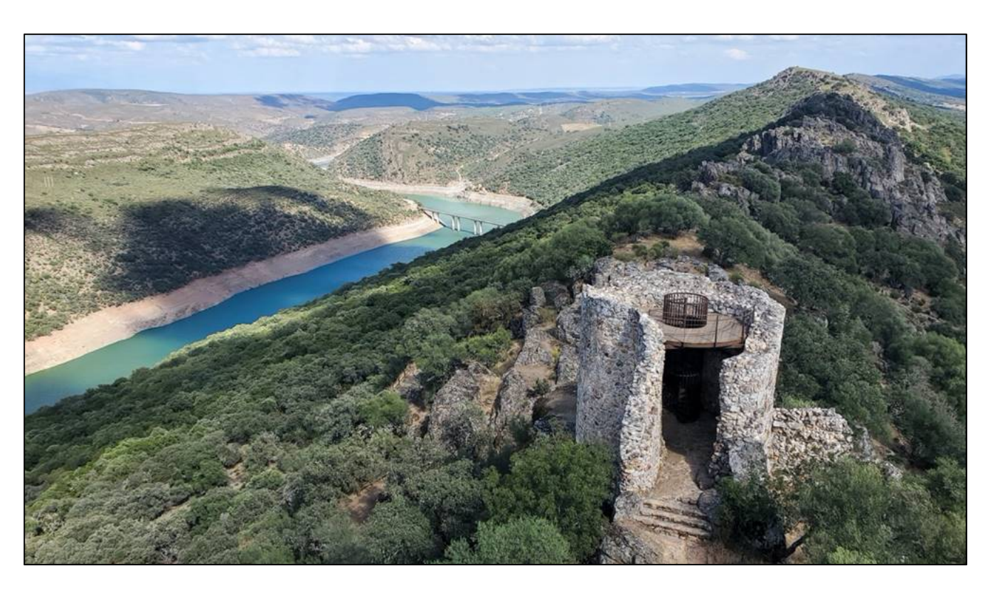
Wednesday, Sept 8: Monfragüe to the Belchite Steppes and Lécera

After another nice outdoor breakfast at Hotel Rutel, we drove to the Portilla del Tiétar overlook with hopes for views of Spanish Eagle. We arrived to find a young Cinereous (Black) Vulture perched on the cliffs beside a Griffin Vulture .