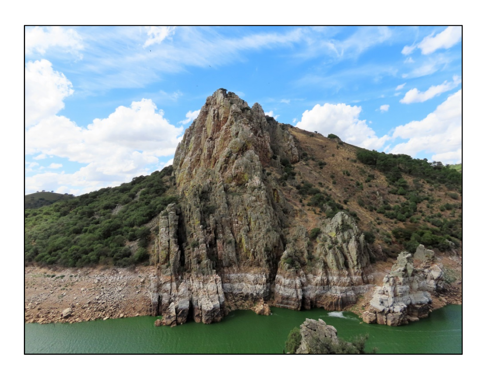
Tuesday, Sept 7: Parque Nacional de Monfragüe – Portilla del Tiétar, Fuente de los Tres Caños, Salto del Gitano overlook, Castillo de Monfragüe

After a lovely outdoor breakfast, we walked down to the overlook through pastures lined with cork oaks. The oaks are often birdy, and we were rewarded with views of Melodious Warbler, 2 Short-toed Treecreepers, Sardinian Warblers, Great and Blue Tits, Nuthatches, and many Chaffinch. At the overlook we had superb looks at Griffin Vultures, Blue Rock Thrushes, and both Golden and Bonelli's Eagles. A striking Rock Bunting also put on quite a display feeding in the open above us.