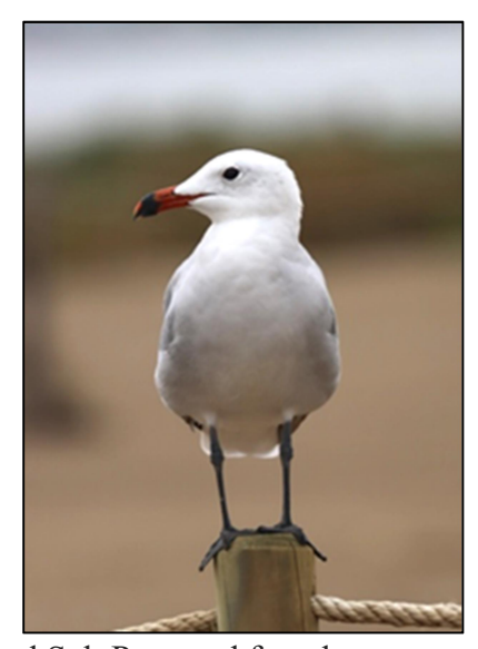
We spent the rest of the morning at the Playa del Trabucador and Salt Pans and found our targets, Mediterranean , Audouin's , and Slender-billed Gulls, and regionally rare Oystercatcher, Shag, and a Merlin. We had wonderful views of along the roadside of several Greenshanks and Spotted Redshanks, before heading to incredibly productive shorebird pools.

Then incredible shorebird pools, where Steve spotted a Marsh Sandpiper (uncommon), and we found 4 Pectoral Sandpipers (rare vagrants), and an amazing 8 Temminck's Stints, along with 3 Gull-billed Terns, and saw huge numbers of migrating Barn Swallows.