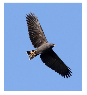
Great Black Hawk