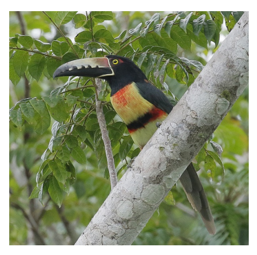
Collared Aracari