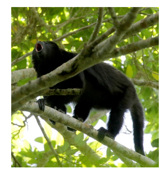
Yucatan Black Howler (Mike Moccio)