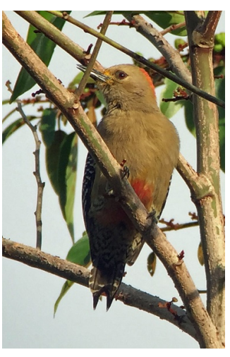
Yucatan Woodpecker (Steve Bird)