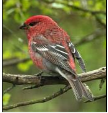
Photos: Puffin, Bluethroat, Snowy Owl, Arctic Redpoll, Ruff, Temminck's Stint, Red-necked Phalarope, Razorbill, Pine Grosbeak by Steve Bird.