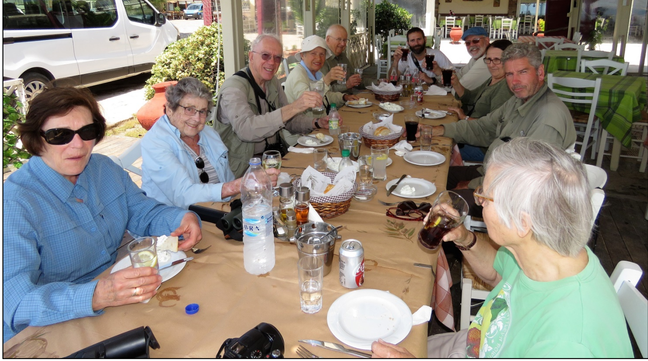
Photos: Little Owl, Cinereous Bunting, Eastern Olivaceous Warbler, Flamingos and Säbelschnäblers, Taverna lunch