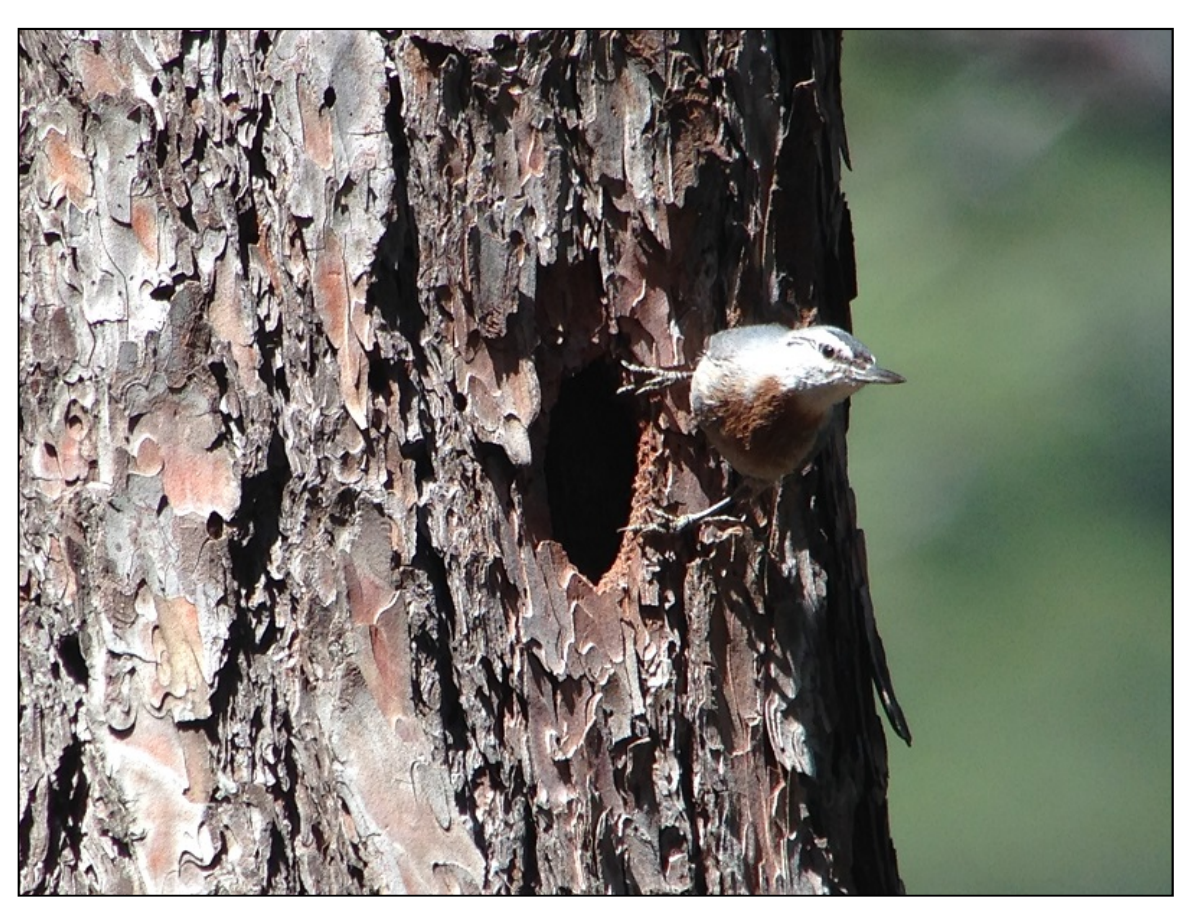
Krüper's Nuthatch.

At the sheep fields, we watched Greater Short-toed Larks feeding in the grass before driving to Achladeri where we parked and walked up a track to nesting tree of a pair of Krüper's Nuthatch , one of the star attractions of the island. We watched as the male and female constantly came to the tree to feed the young which were close fledging as they were almost sticking their heads out of the hole.