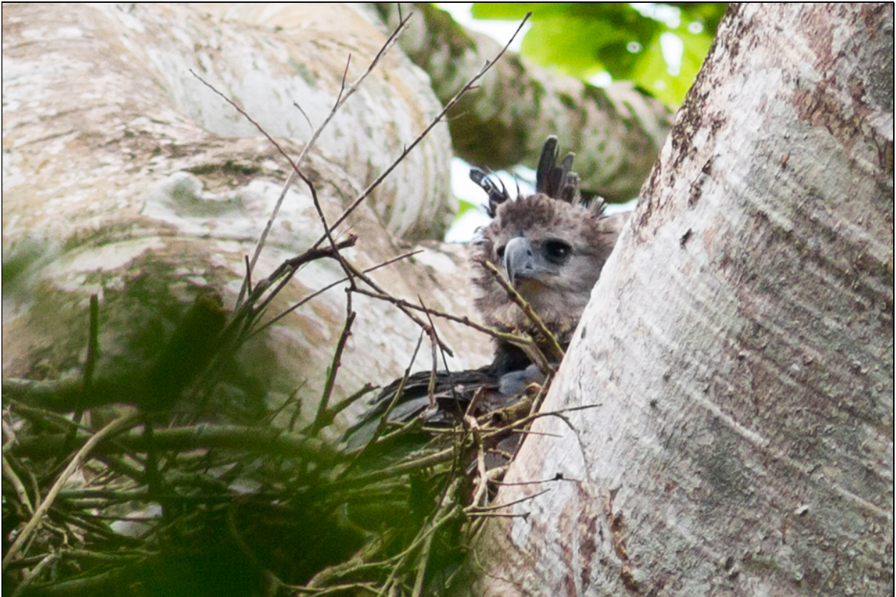
Photos, top to bottom: Striped Cuckoo, Great Potoo, Harpy Eagle. Our group was the first to see this Harpy Eagle at its nest site!