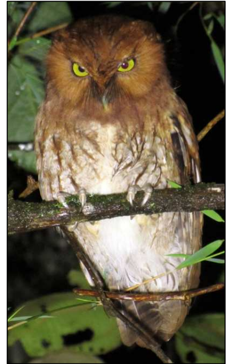
Unnamed, new species of Screech-Owl ( unofficially known as Santa Marta Screech-Owl! )