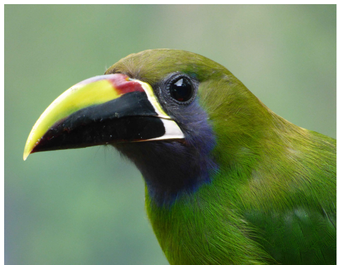
Northern Emerald Toucanet

On the way back to the hotel, we made a stop in an open grassland area where we found a really unusual record in Costa Rica, a dark-morph Red-tailed Hawk ! Depending from where you live in North America, this may sound like nothing very special, but it is if you're in Costa Rica! This was, by the way, my first time seeing this morph on any Red-tailed Hawk subspecies! Arriving back at the hotel after a great day in the Pacific, a couple of spectacular Spot-breasted Orioles welcomed us back.