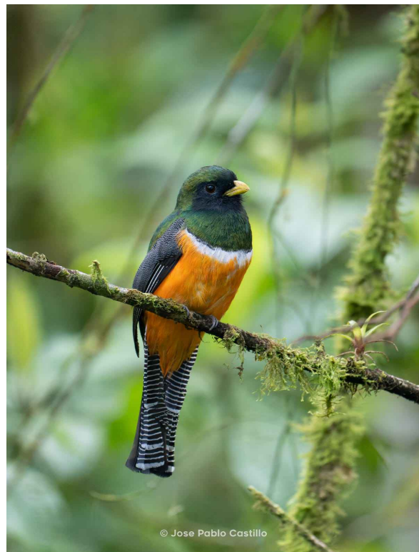
Collared Trogon (Orange-bellied)