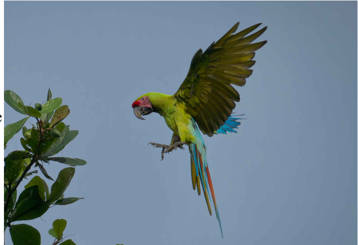
Great Green Macaw

After a nice breakfast at the hotel we loaded the bus and started driving to the Central Volcanic Mountain Range in direction towards the Poás Volcano, one of the 6 active volcanoes in Costa Rica! On the way we went through the Alajuela city and as we were going up the mountains we passed several coffee and strawberry plantations. Our first stop was in a bridge that give us nice and close views of the canopy of a small riparian forest. Here we're spotted Mountain Elaenia, Mountain Thrush, Spangle-cheeked Tanager , Long-tailed Silky-Flycatcher , Yellow-bellied Siskin and Wilson's Warbler.