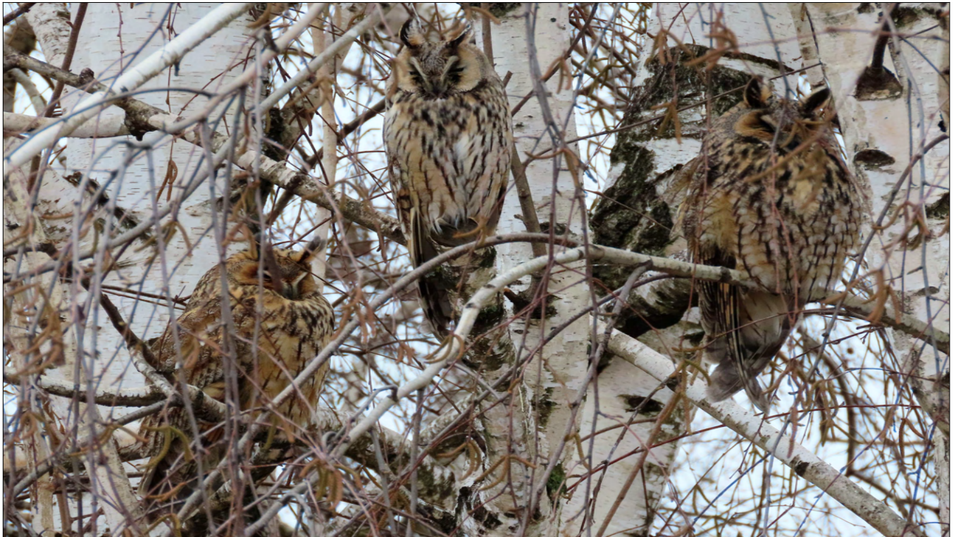
Tawny Owl, Syrian Woodpecker, Eastern Imperial Eagles, Little Owl, Pygmy Cormorant, Long-eared Owls