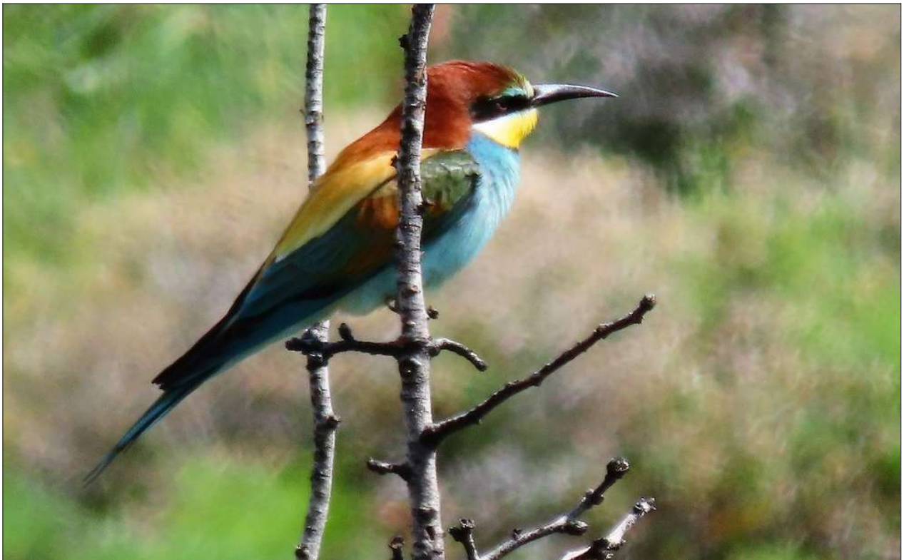
Photos: Golden Oriole, Scop's Owl, Collared Flycatcher, Lesvos Orchid, Glossy Ibis, Citrine Wagtail, Bee-eater.